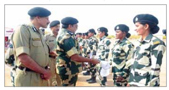
Mahila Contingent of the BSF