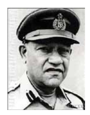
An Officer in Uniform with Collar Tabs