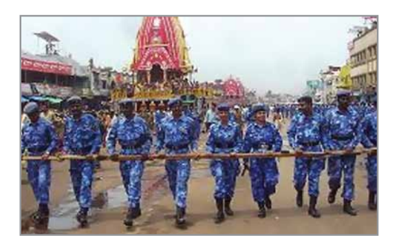
RAF Unit on Duty

According to the CRPF Act and Rules, the Force acts in aid of civil power. Its main role is to help the states/union territories to maintain law and order. Besides dealing with riots, it has over the past few years also been deployed on anti-insurgency and anti-terrorist operations, VIP security, aviation security, protection of vital installations, election duties, guard duties, army convoy protection duties etc.