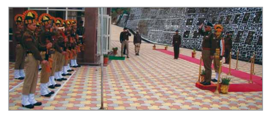
An ITBP Officer Taking the Salute

The Force is headed by a Director General, who is assisted by an Additional Director General. The headquarters has four Directorates- Provisioning, Operations, Personnel and Works & Welfare, each headed by an IG. The field establishment is divided into Frontiers, Sectors and Battalions. There are 5 Frontiers, each under an IG, 15 Sectors, each commanded by a DIG and 56 Service Battalions. In addition, there are 4 Specialised Battalions, 2 DM Battalions and 17 Training Centres. The total strength of the Force on 1.1.2015 was 89, 438.82