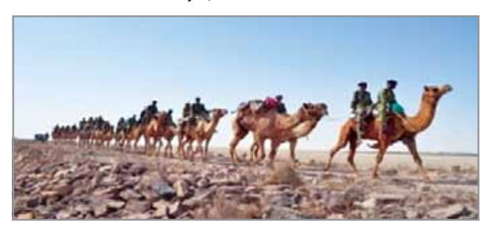
Camel Contingent of the BSF Patrolling the Rajasthan Border