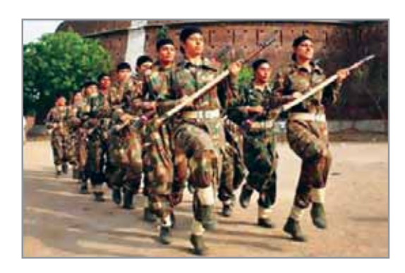
Mahila Contingent from CRPF Undergoing Training